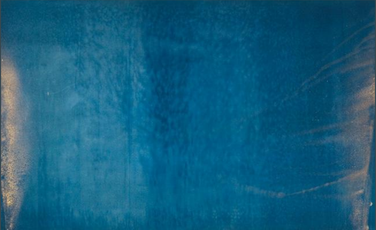
Fujimura, Silence - Kairos